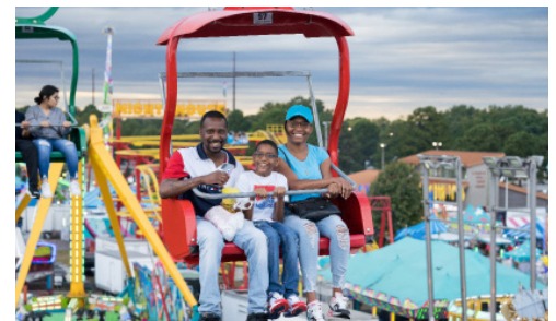
STATE FAIR FLYER CHAIR LIFT

$10 value Ag Bucks Voucher - $12 Ag Bucks are valid for redemption for food, drink and/or products at participating vendors.