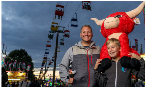
2026 N.C. STATE FAIR ADMISSION TICKETS

Deadline for all self-serve purchases is October 1, 2026, and the deadline for hard tickets (including Ag Bucks for food) is October 1, 2026.