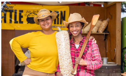
STATE FAIR AG BUCKS

$10 value Ag Bucks Voucher - $12 Ag Bucks are valid for redemption for food, drink and/or products at participating vendors.