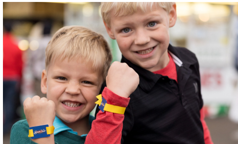
RIDE TICKET VOUCHERS & UNLIMITED RIDE WRISTBANDS**

Ticket price includes all applicable state and local sales tax. The N.C. State Fair operates rain or shine, and does not offer refunds.