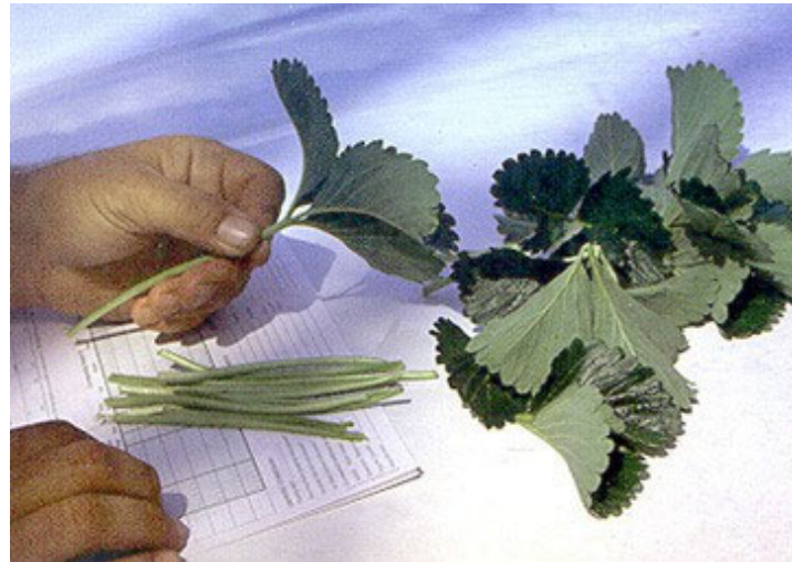
Fig. 2. Collecting a strawberry sample for plant tissue analysis.

Immediately detach petioles from the trifoliate leaves. This action stops nutrient transfer between the two plant parts, which are analyzed separately and for different purposes. Leaf analysis detects nutrient deficiencies and imbalances within the plant—it reports the nutritional condition of the plant. Petiole analysis is more sensitive to changes in available soil nitrate, which allows for a more precise nitrogen rate recommendation that is responsive to changing soil nitrogen conditions.