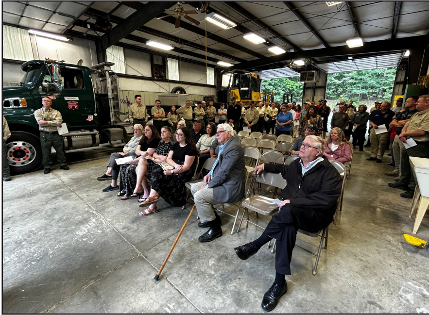
Family, officials, N.C. Forest Service personnel, firefighters and community members attended the dedication ceremony.