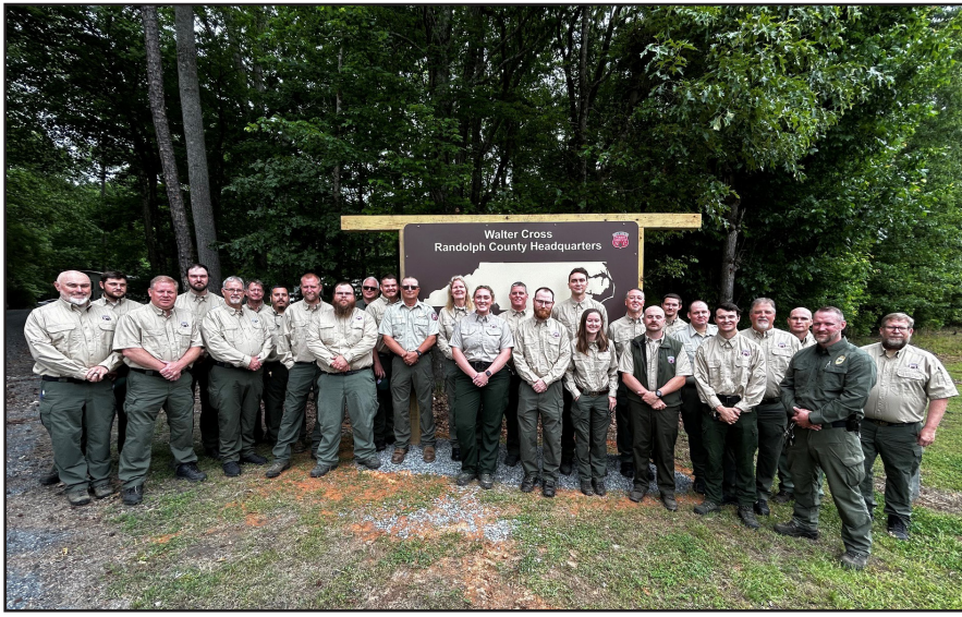
N.C. Forest Service personnel stand with the newly unveiled road sign.