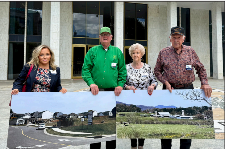
Farmers and advocates traveled from across the state.

grant cycle, requests for farmland preservation funding totaled $59 million, yet only $3.1 million in new funding was available for awards. That gap represents working farms and forests across North Carolina that remain unprotected despite willing landowners and local support.