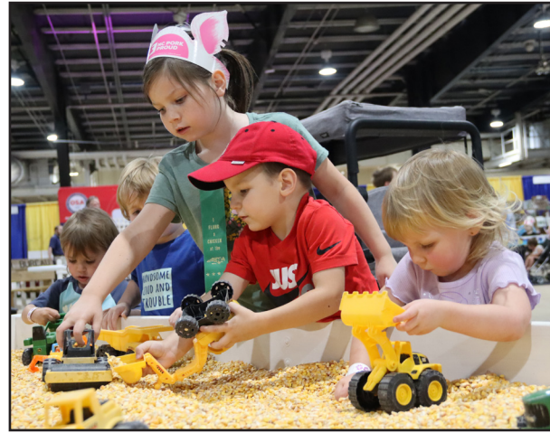
Excavator fun in the NC 529 Kidz Corral.