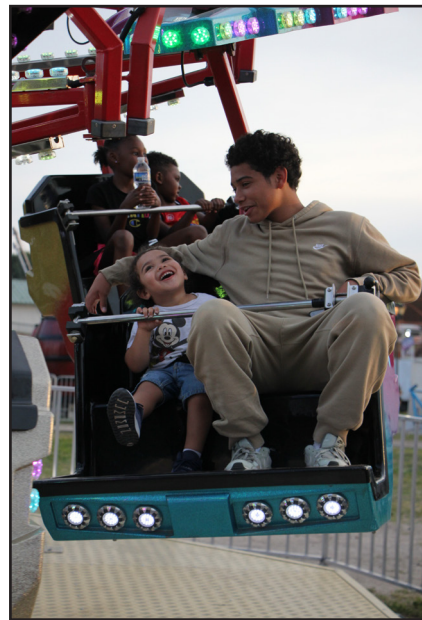
Rides and games, all day!