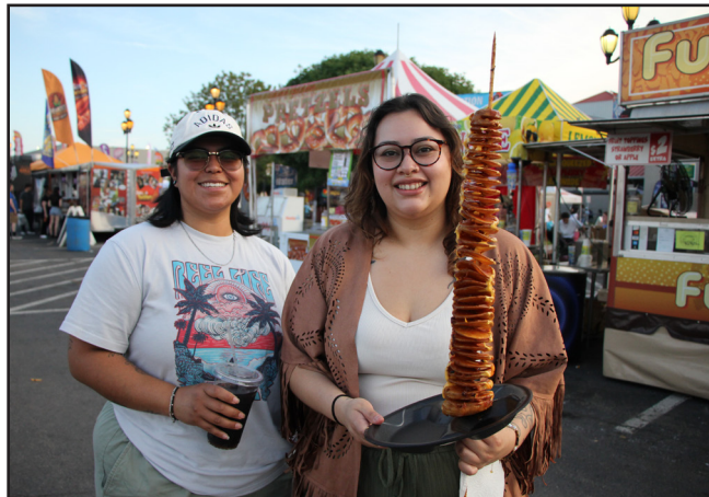
Twisted tater? Yes, please!