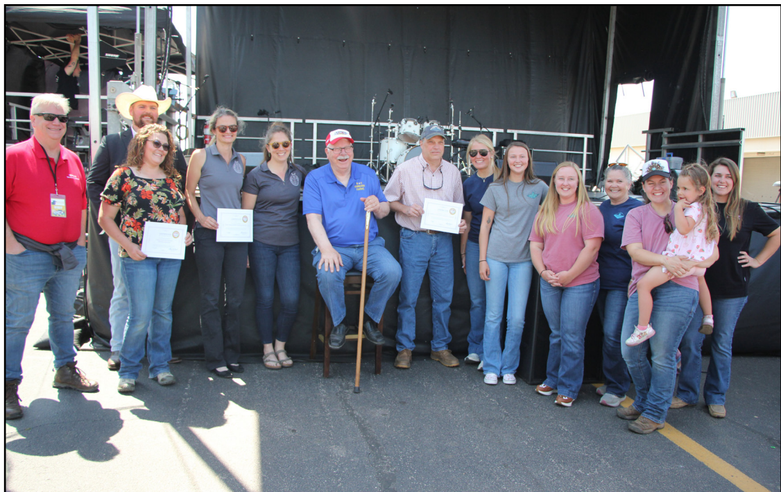
The grantees were recognized at the Got to Be NC Festival in May.

Twelve North Carolina veterinary practices were recently awarded grants to help support their large animal practice. The Large Animal Healthcare Enhancement Grant is a $130,000 recurring fund created by the N.C. General Assembly in 2023 and is administered by the N.C. Ag Finance Authority.