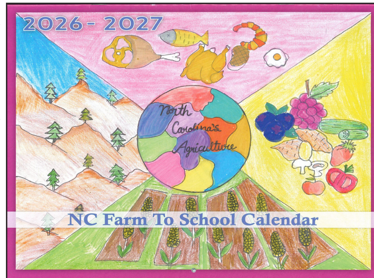
The cover of the 2026-27 Farm to School calendar.

The North Carolina Grange is a nonprofit, grassroots organization dedicated to strengthening agriculture and rural communities across the state.