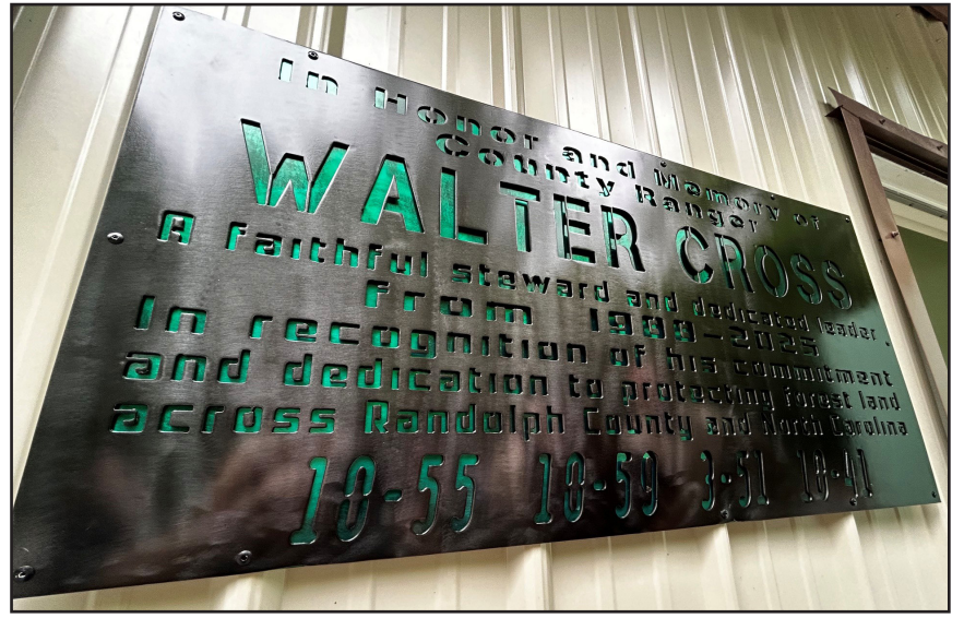
This metal sign adorning the building details Cross's nearly 37-year career.