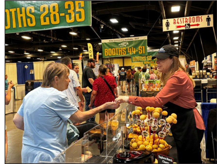
Tasty samples in the Got to Be NC Pavilion.