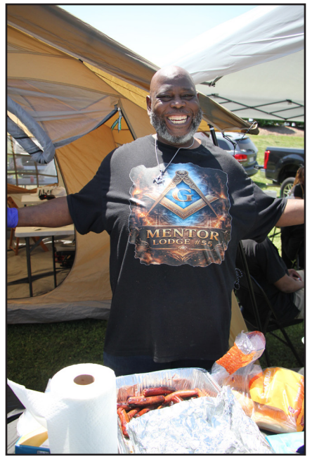
All smiles at the Pig Jig!