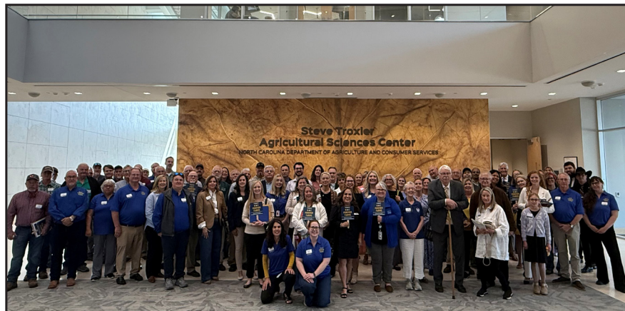
The group pictured at the Steve Troxler Agricultural Sciences Center.

The Agricultural Development and Farmland Preservation Trust Fund supports the farming, forestry and horticulture communities within the agriculture industry, purchasing agricultural conservation easements, funding public and private enterprise programs to promote profitable and sustainable family farms, and providing funding for conservation easements targeted at the active production of food, fiber