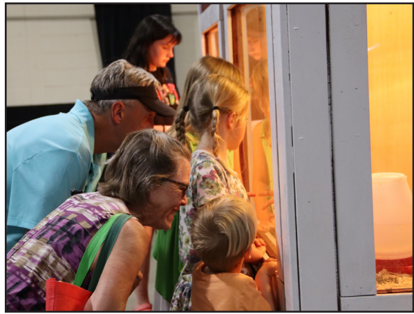
'Peep' the hatching chicks.