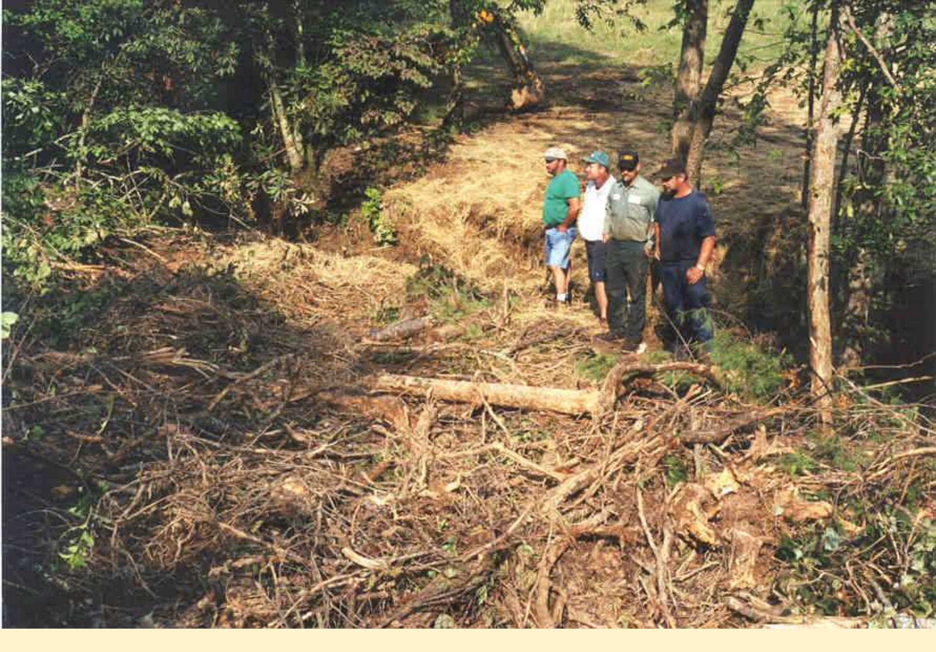
Another stream crossing stabilized, with slash & straw.