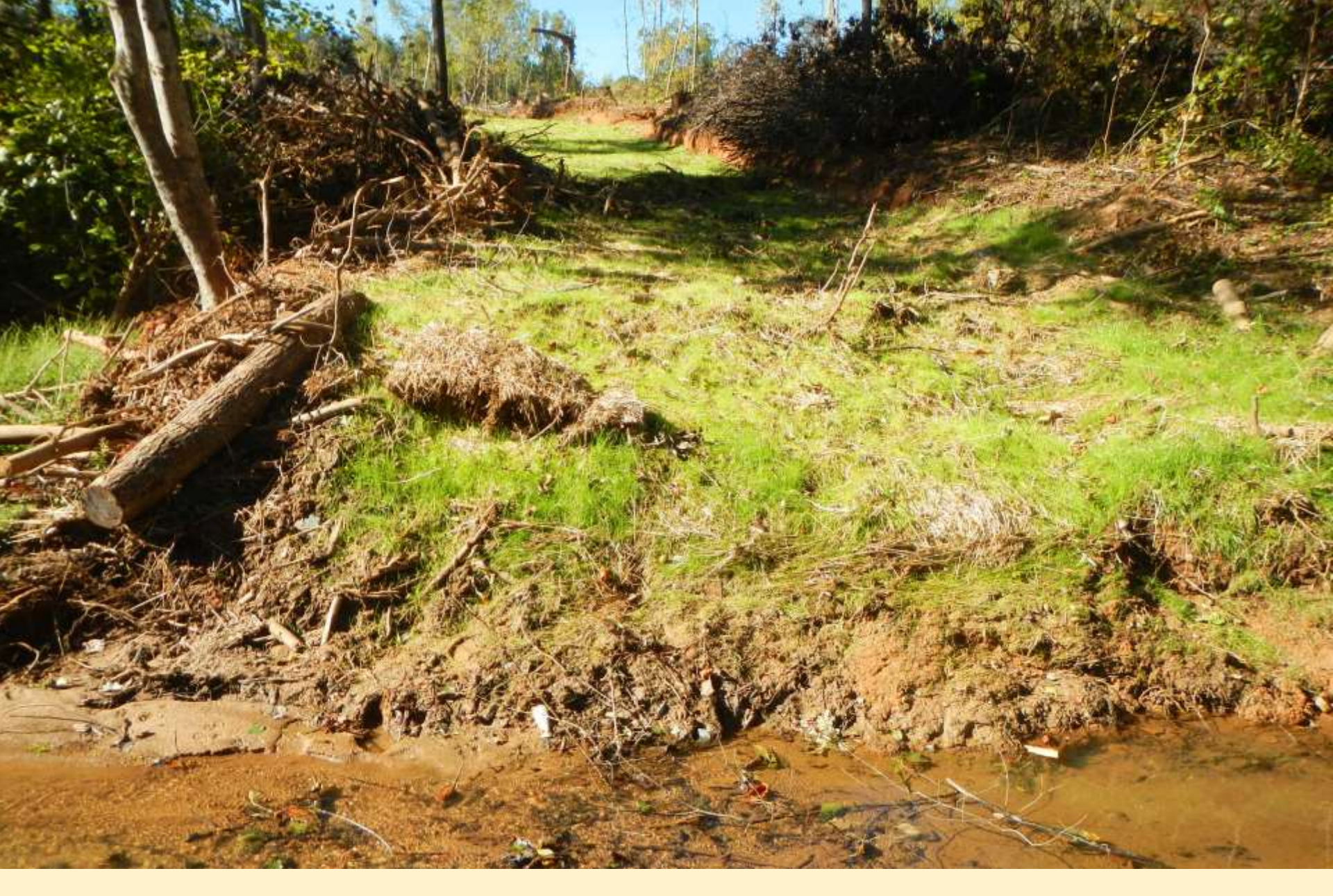
Pretty good job, would be nice if stream bank was covered.