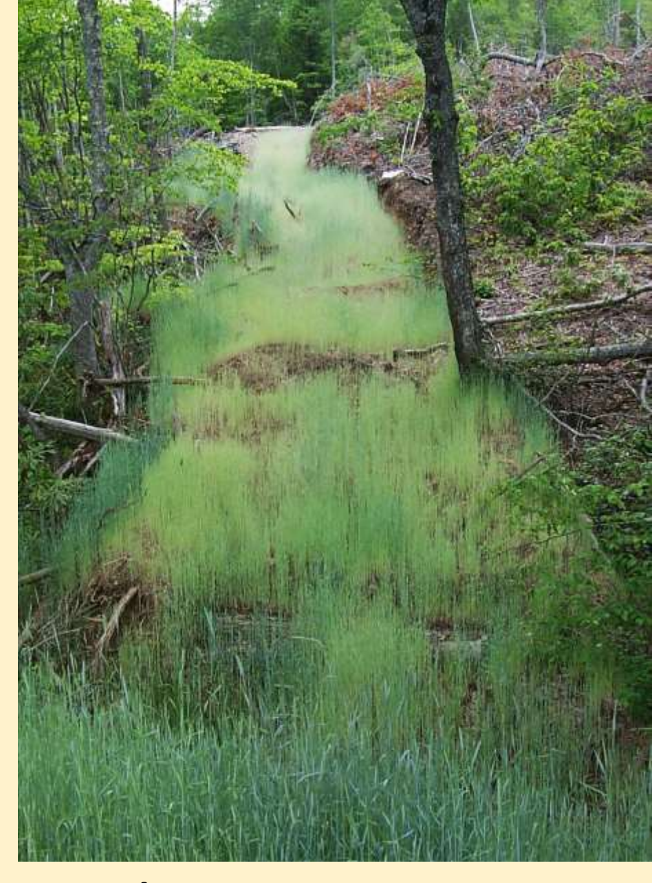
Steep Slopes = More BMP Work. Slow It Down... & Spread It Out!