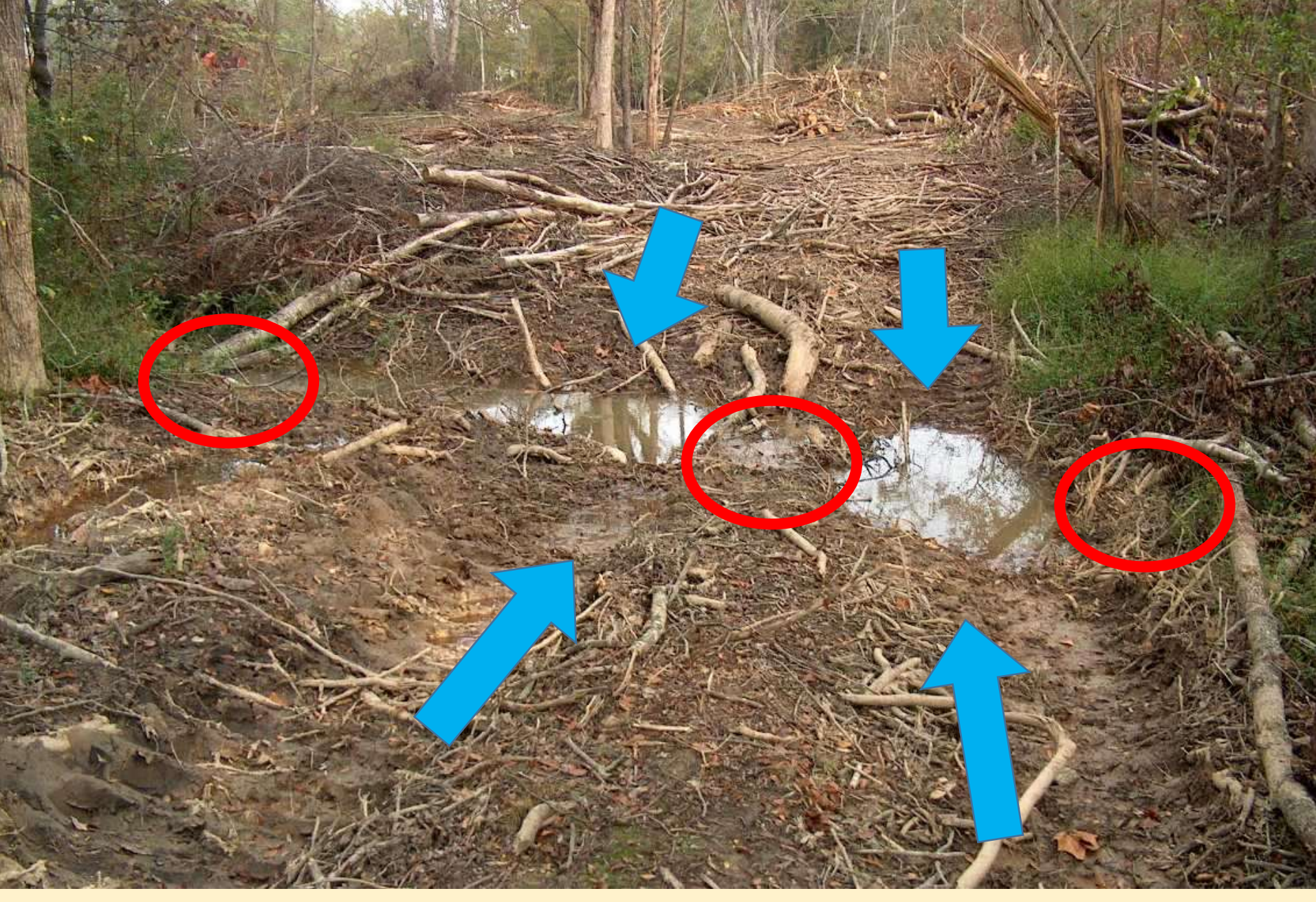
Is any rehab work needed on this crossing?