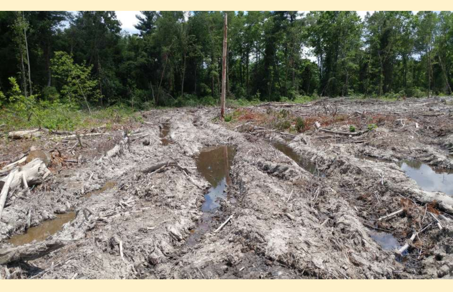
Rehab work can remediate soil & site productivity, in addition to protecting water quality.