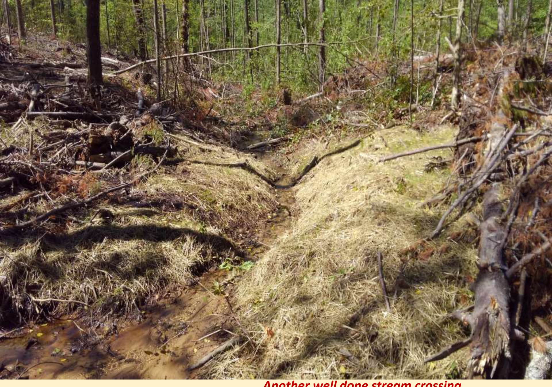
Another well done stream crossing. (are you starting to see a common theme?...)