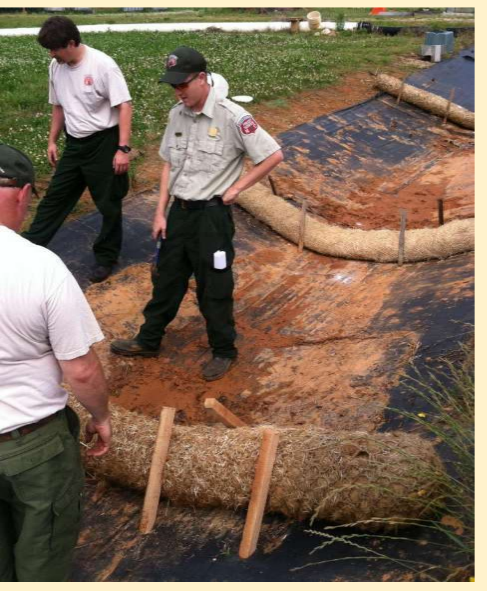
LEFT: Coir Logs, Straw Wattles