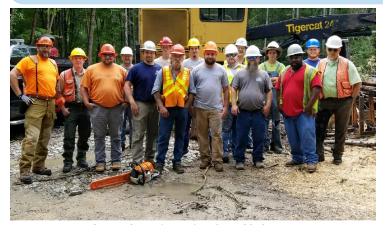
ProLogger Base Course Group in Marion, Sept. 2018