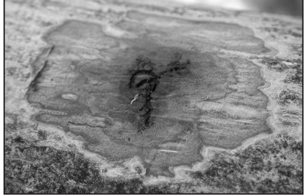
Figure 3 : Canker development around a walnut twig beetle gallery in English walnut.