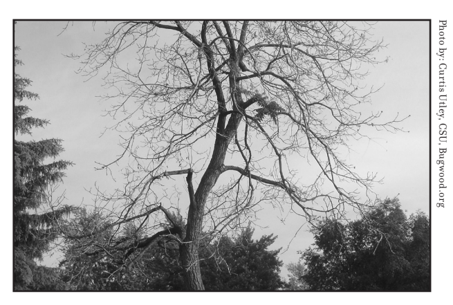
Figure 4: A black walnut tree killed by thousand cankers disease.

Thousand Cankers Disease—Pest Alert. http://na.fs.fed.us/pubs/palerts/ cankers_disease/thousand_cankers_ disease_screen_res.pdf