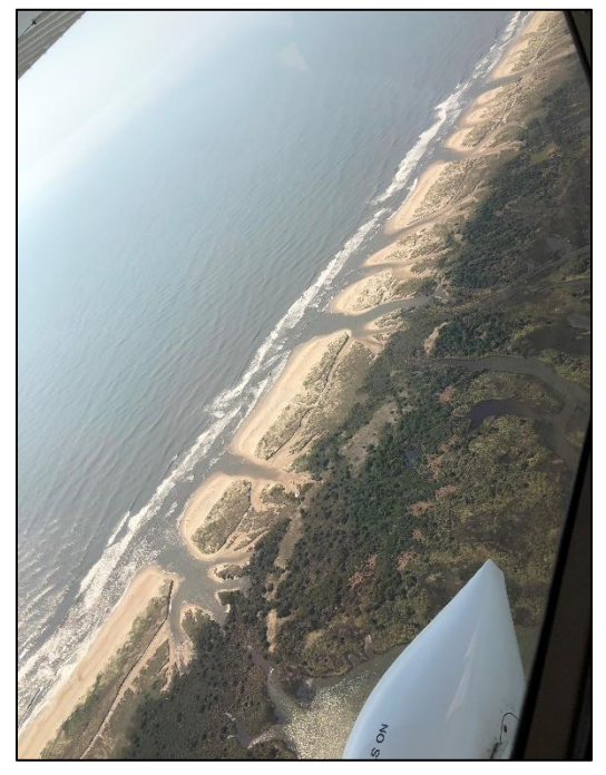
Erosion from the storm washed out and reshaped beaches on North Carolina's beloved Outer Banks, such as Cape Lookout National Seashore, shown here.

Timber damage recon flight. On September 7, Wayne Langston and Kelly Oten of the Forest Health Branch flew a recon flight over areas impacted most by the storm. Of greatest interest were the Croatan National Forest and forested and urban areas falling within the hurricane force wind swath. If this recon flight showed extensive damage to forest trees, a thorough and systematized survey would be planned and conducted.