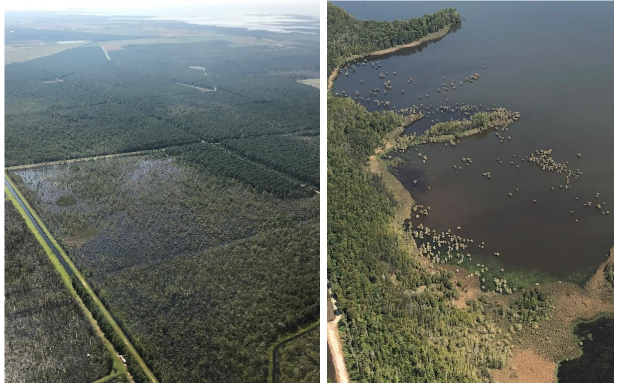
Flooding will likely have significant impacts on trees, primarily because many trees in this area are already stressed from a hurricane-wet season-dry season cycle. Standing water was observed in forest stands (left; Swanquarter) and high water in Lake Mattamuskeet submerged trees along its shore (right).