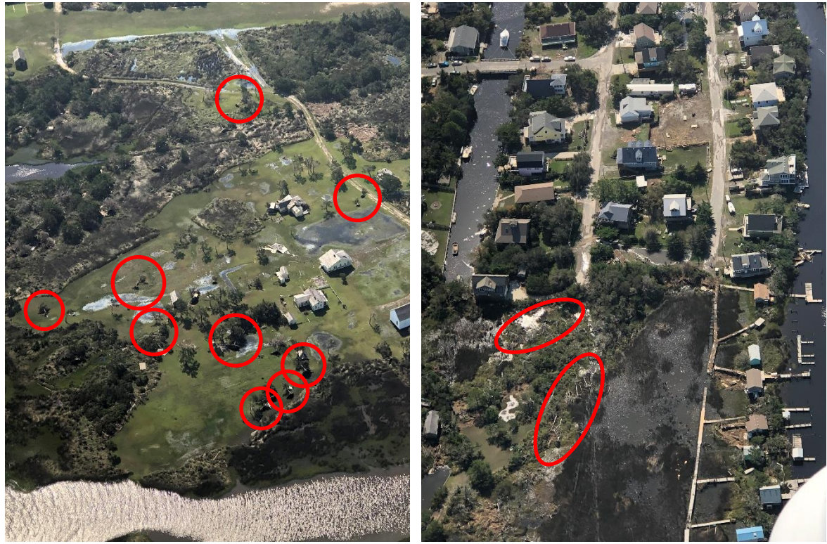
Downed trees from Hurricane Dorian were observed sporadically, mostly along the Outer Banks, including Portsmouth (left) and Ocracoke (right). Fallen trees are circled in red.