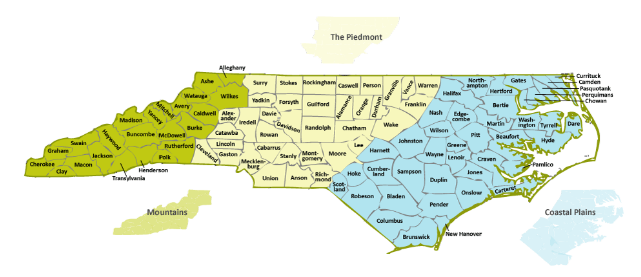
Figure 2: North Carolina regions by county

Wake County was established in 1771 in central North Carolina and is on the boundary of the state's piedmont and coastal plain. Raleigh was made the county seat upon creation of the county. In 1792, Raleigh was made the state capital. The county is made up of a total of 835 square miles<sup>21</sup>. The county is bordered by 6 counties: Chatham and Durham Counties to the west, Granville and Franklin Counties to the North, Johnston County to the east, and Harnett County to the south. According to NCPedia.org, Wake County is one of North Carolina's most urbanized counties. This is due largely to the impact of state governmental offices that are located in the county, colleges and universities, and many large businesses and corporations in and around the Research Triangle Park. While the county has transitioned from being largely rural and agricultural, the county is still home to almost 700 farms<sup>22</sup> producing nursery crops, vegetables, row crops, and livestock. Manufacturing continues as a major component of the economy in Wake County today, largely based in technology, pharmaceutical products, and communications<sup>23</sup>.