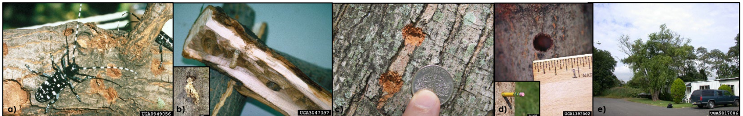
a) Adult ALB ; b) ALB larva tunneling in branch and inset shows frass build-up caused by larvae tunneling under bark ; c) Egg niches where a female ALB has chewed the bark to create a pit to deposit an egg ; d) ALB exit hole (roughly 3/8");); inset image shows pencil in exit hole for size reference and to differentiate from carpenter bee activity [ALB tunnels straight through wood and carpenter bee goes in and down] ; e) Beginnings of tree dieback caused by ALB infestation

The Asian longhorned beetle ( Anoplophora glabripennis ; ALB) is native to Asia and was first detected in the United States in 1996 in Brooklyn, NY. This invasive insect has since been found in other parts of New York, Illinois, Massachusetts, New Jersey, Ohio, and South Carolina. This pest is not known to occur in North Carolina, but early detection is critical for protecting North Carolina agriculture, businesses, and forests.