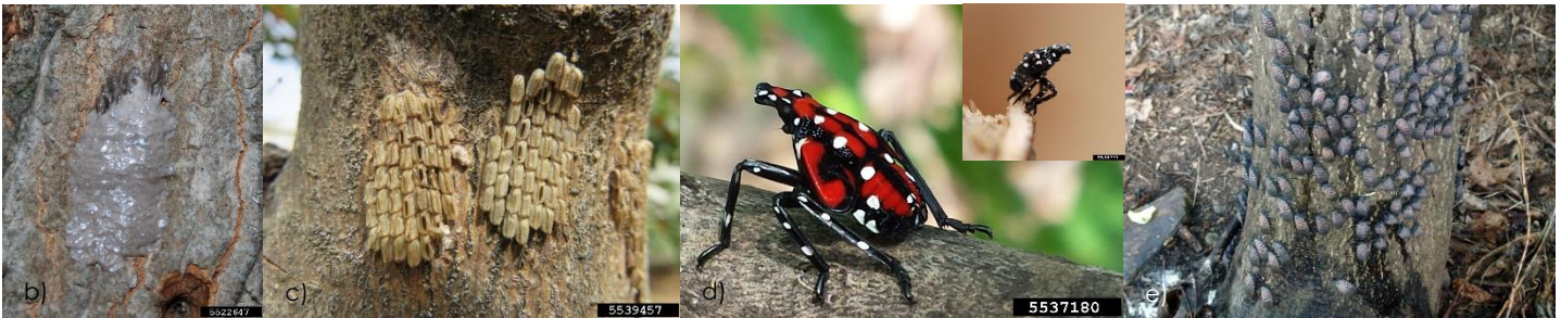
a) Spotted lanternfly adult ; b) Spotted lanternfly egg mass ; c) Spotted lanternfly eggs after hatching ; d) Late stage spotted lanternfly nymph with early stage nymph in inset ; e) Spotted lanternfly adults on Ailanthus with damage to tree evident in weeping wounds

Spotted lanternfly, Lycorma delicatula (White), is an invasive planthopper that was first detected in the United States in Berks County, Pennsylvania, in 2014. The pest is native to northern China and was introduced to Korea in 2004 where it has become a major pest. This pest is not known to occur in North Carolina but early detection is critical for protecting North Carolina businesses and agriculture.